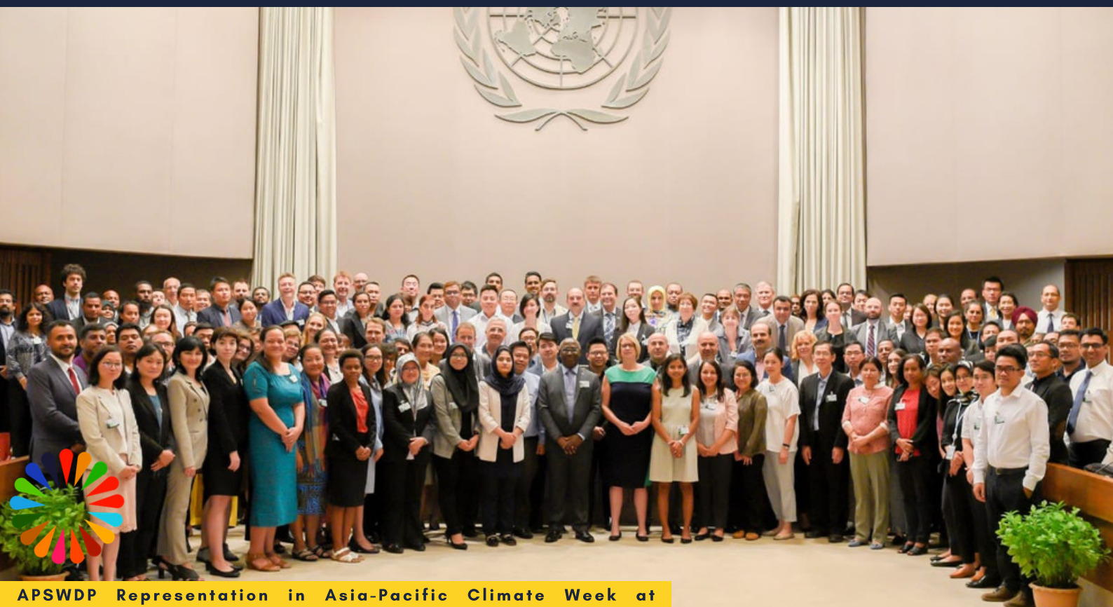
APSWDP Representation in Asia-Pacific Climate Week at UNESCAP, Bangkok, Thailand.