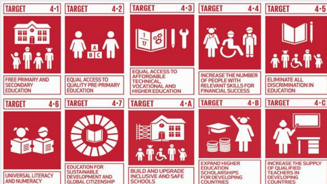
PICTURE: SUB TARGETS OF SUSTAINABLE DEVELOPMENT GOAL 4: QUALITY EDUCATION

At the end of 2019, there were still millions of children out of school. The closure of schools in 2020 as part of the measures taken to slow the spread of COVID-19 is having an adverse impact on the learning outcome. It has affected more than 90 percent of the world's student population, with an estimated 1.5 billion children and young people having disrupted access to education. Across the world, limited access to the internet has also adversely impacted students' ability to engage in learning opportunities.