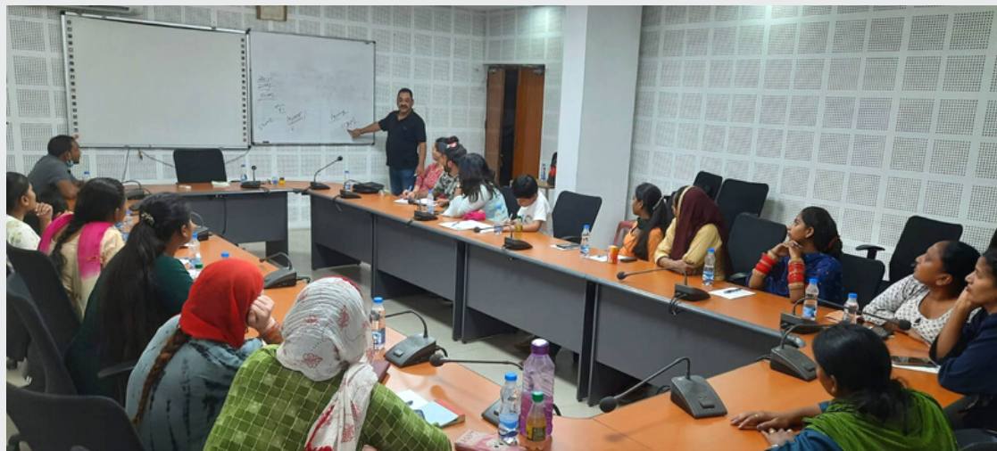
PICTURE: CAPACITY BUILDING ON DECENT LIVELIHOOD GENERATION THROUGH SHGS AND COOPERATIVES AMONG MARGINALIZED COMMUNITIES AT RICM CHANDIGARH.