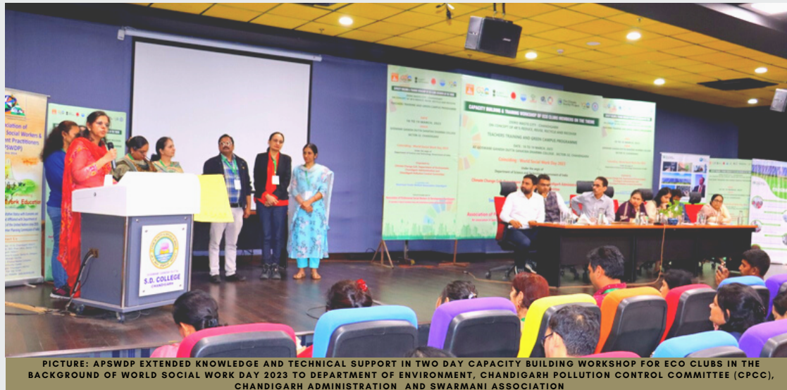
PICTURE: APSWDP EXTENDED KNOWLEDGE AND TECHNICAL SUPPORT IN TWO DAY CAPACITY BUILDING WORKSHOP FOR ECO CLUBS IN THE BACKGROUND OF WORLD SOCIAL WORK DAY 2023 TO DEPARTMENT OF ENVIRONMENT, CHANDIGARH POLLUTION CONTROL COMMITTEE (CPCC), CHANDIGARH ADMINISTRATION AND SWARMANI ASSOCIATION