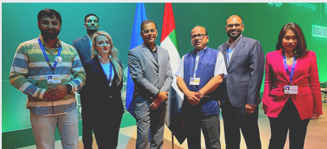
PICTURE: APSWDP BEING REPRESENTED AT COP 28 UNFCCC AT DUBAI