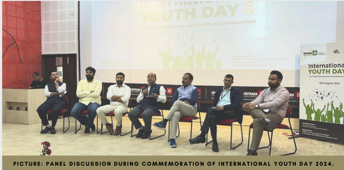
PICTURE: PANEL DISCUSSION DURING COMMEMORATION OF INTERNATIONAL YOUTH DAY 2024.