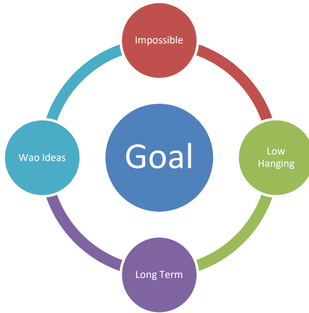
Figure 1: Future Roadmap

During the discussion, the following points were emphasized: